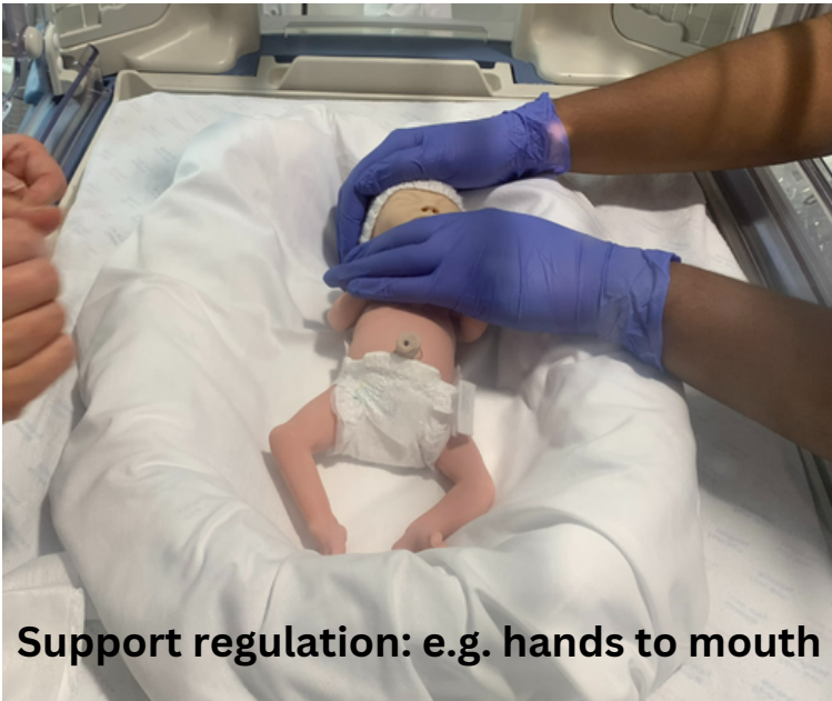
Support regulation: e.g. hands to mouth

Person one provides containment facilitating self regulation behaviours such as hands to mouth.